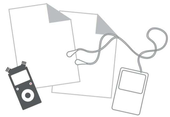
Blank paper Recording material MP3/MP4 players