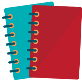
Books Dictionaries Notes