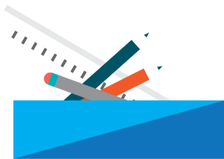
Pencil case (on desk)